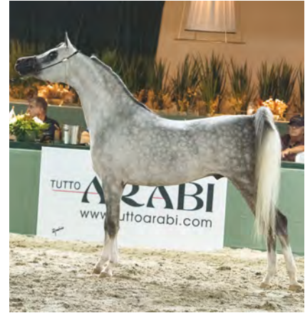
Fattaly D'Ali JM Bronze Champion Stallion