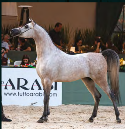
Bronze Champion Colt Destiny HEC