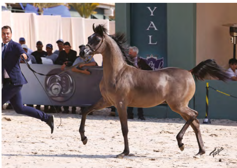
Bronze Champion Junior Junior Colt Samurai Do Divino