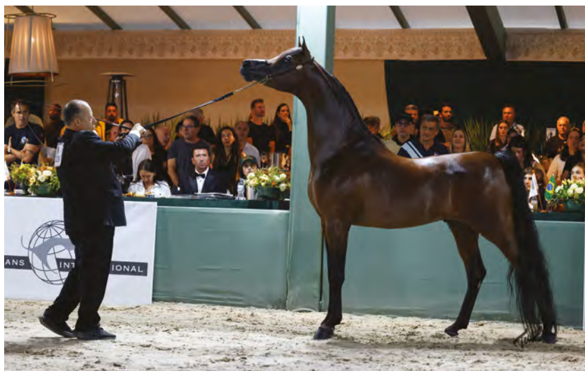
Gold Champion Stallion Aria Rakeem