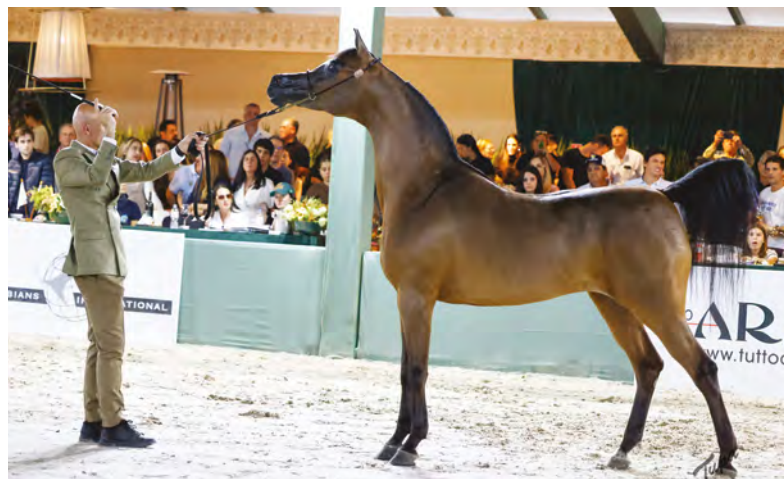
Bronze Champion Mare Felma La

in breeding. With her latest title, Felma LA continues to add to her Nationals show record. She previously won the Silver Sr. Mare title last year and the 2022 Silver Jr. Mare.