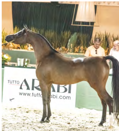
VV Yasmin Silver Champion Mare