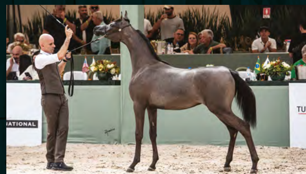
Bronze Champion Junior Junior Filly HK Vizzionata VB