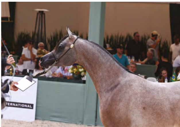
Bronze Champion Junior Colt Invictus HVF