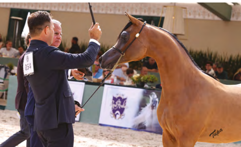
Silver Champion Junior Colt RFI Nadim

Gran Ravello’s dam, Sweet Visioneri, is a daughter of PCF Vision by Marwan Al Shaqab, who also sired the imported Luxemere Baroness, the 2011 Brazilian National Champion Mare. Haras De Al Hosçan continues its tradition of naming stallions with the prefix “Gran” and its mares with “Sweet”, a creative and romantic naming convention.