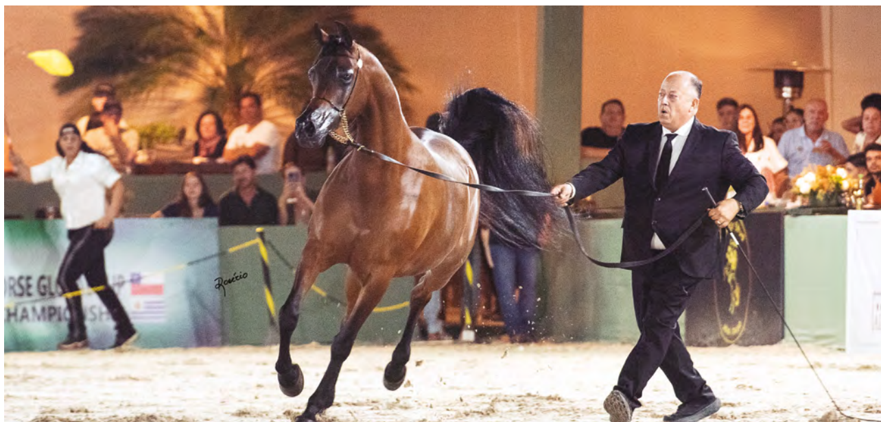
Gold Champion Mare Preferida Rach

The unanimous Senior Mare Champion , Preferida Rach, has now claimed her seventh National Championship title. She won Bronze Yearling Filly in 2017, Bronze Young Filly in 2018, Gold Filly in 2019, Silver Jr. Mare in 2020, Gold Jr. Mare in 2021, Silver Sr. Mare in 2022, and now Gold Sr. Mare. As one of the leading symbols of the prestigious Rach Stud, owned by the Saliba family, Preferida Rach represents a breeding program with 39 years of history and nearly 2,000 Arabian horses produced. Preferida is the daughter of Bandit SRA, which ranks among the most in-demand sires in Brazilian breeding and is currently leased to Rae Dawn Arabians in USA. Bandit SRA also sired two more Gold Champions at this year's National Championship: Jr. Mare Carandá Lulikah and Yearling Filly Black Pearl RLG.