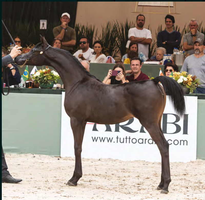
Gold Champion Junior Junior Filly Black Pearl RLG