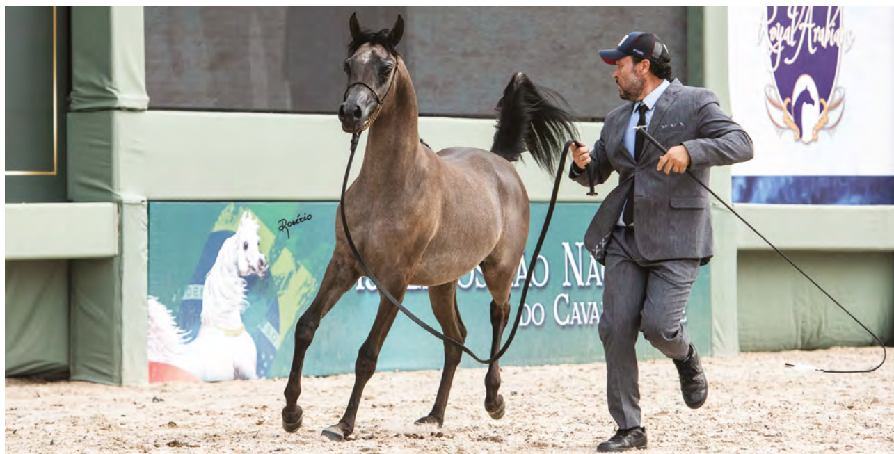
Gold Champion Junior Colt Gran Ravello