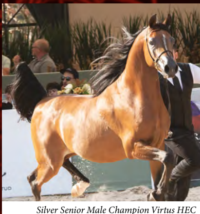
Silver Senior Male Champion Virtus HEC