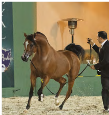
Gallax D'Ambition JM Silver Champion Colt