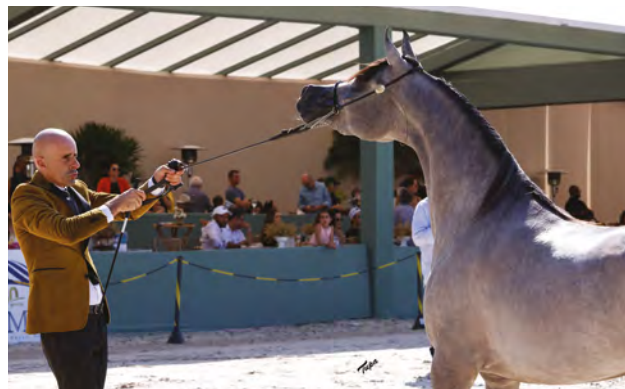
Bronze Champion Filly Ft Simphonia