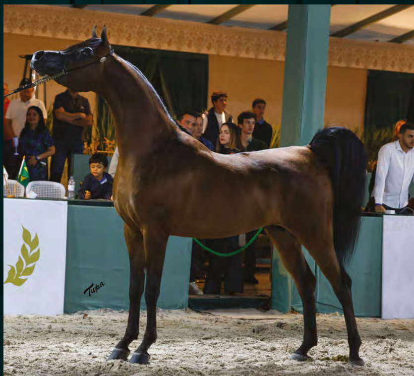
Gold Champion Young Stallion Maximillion Na

The Junior Stallion Championship delivered an exhilarating and closely contested competition. Judges converted their rankings for each horse into points; the highest scores determined the champions. The Gold winner scored 25 points, the Silver earned 24, and the Bronze received 22, showcasing the intensity of the Championship.