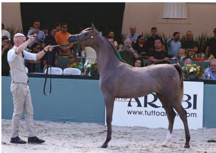
Silver Champion Junior Junior Colt HDF Rafiq