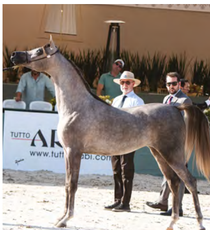
Intenzza Lugano JM Silver Champion Junior Filly