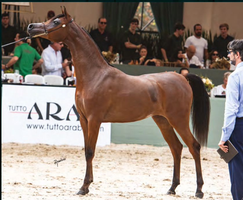
Gold Champion Junior Filly Princess Dominica