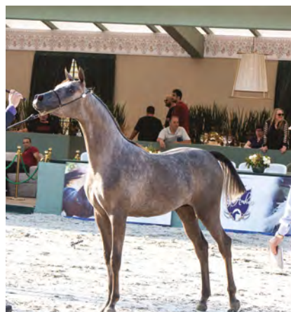
Ishangai Di Capri JM Bronze Champion Junior Colt