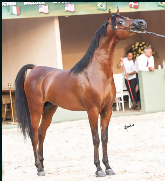
Gold Champion Colt Azkaban El Farid Rb