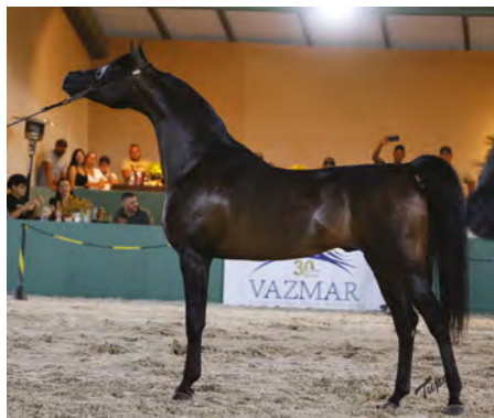
Silver Champion Stallion Vivaldi Al Shawan