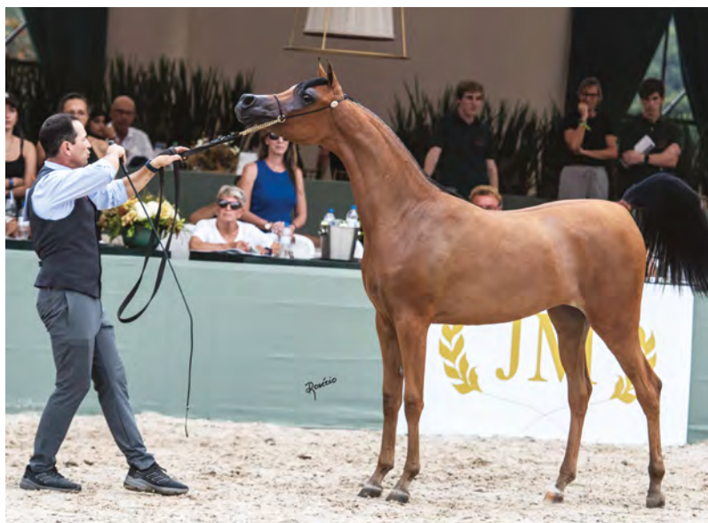
Silver Champion Junior Filly VV Abilah