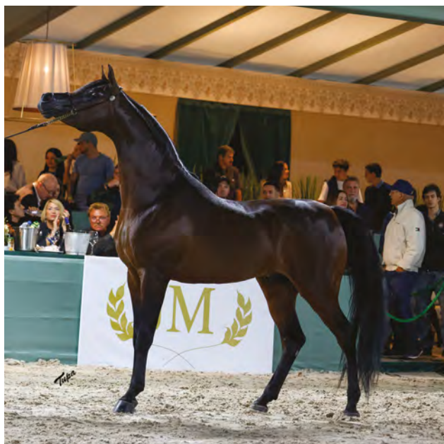
Silver Champion Young Stallion Gael W