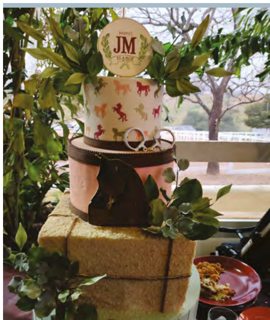
JM Party - 35 year's celebration

Guests enjoyed a lavish lunch, live performances, and lively samba music. The day's highlight was a breathtaking showcase of exceptional horses during the Brazilian Farm Tour, capping off a thrilling and successful week.