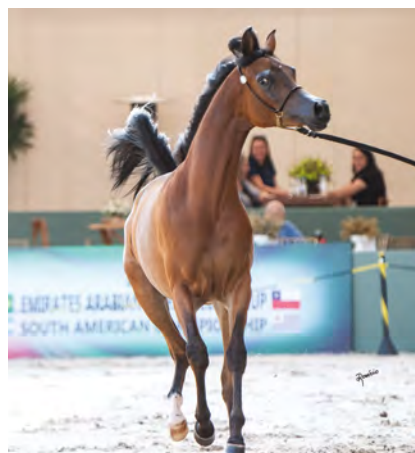
Pretendida Rach Bronze Champion Junior Filly