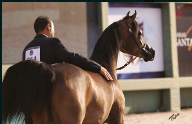
Silver Champion Young Filly Mirna UB