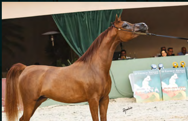
Bronze Champion Young Filly Acqua Serondella