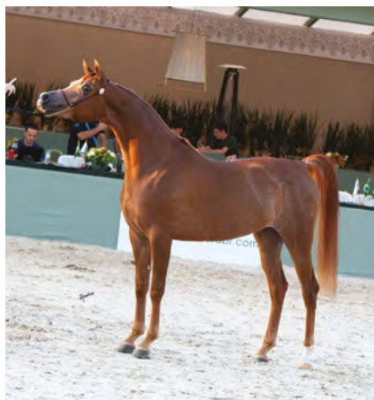
Saryanna HVP Gold Champion Filly