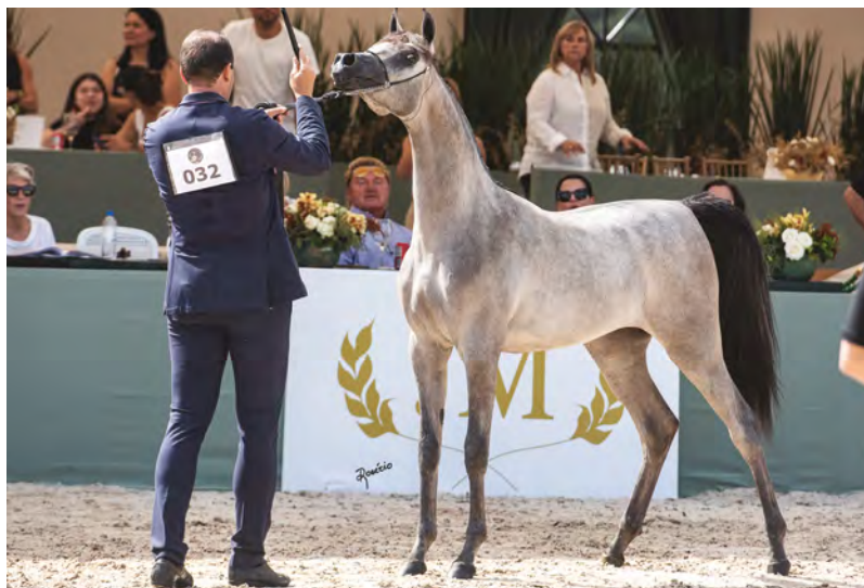
Bronze Champion Junior Filly Penelope JSZ