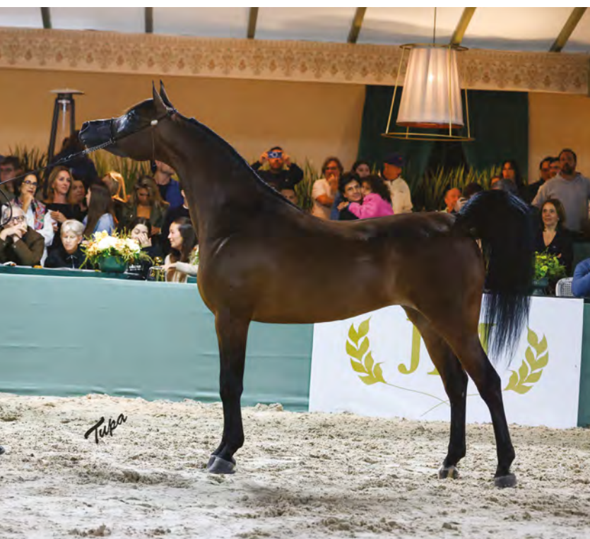
Gold Champion Young Mare Carandá Lulikah