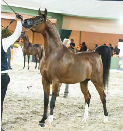
Virtus HEC Gold Champion Stallion