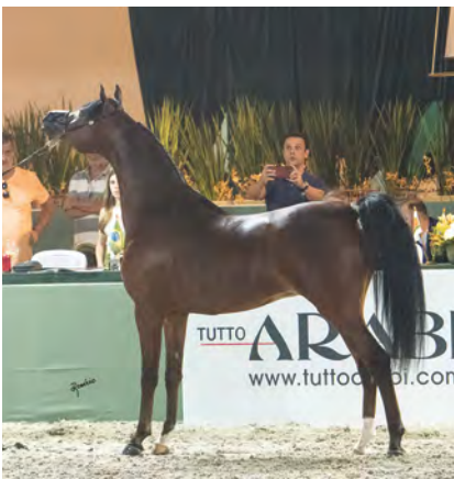
RFI Marquis Gold Champion Colt