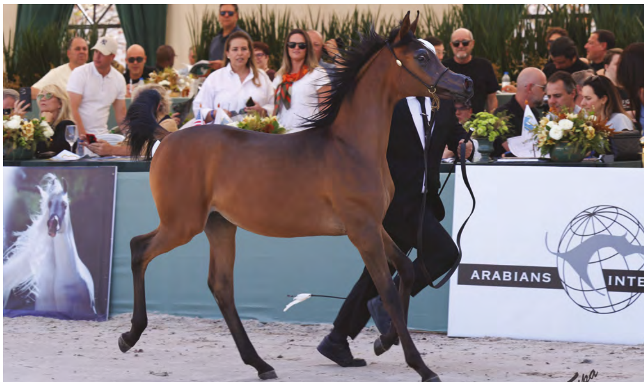
Gold Champion Junior Junior Colt Bhaarez Serondella