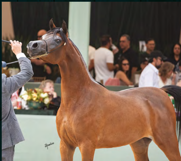
Gold Champion Young Filly Almaah Serondella

The Young Filly Championship Almaah Serondella dominated the Young Filly Championship, unanimously earning the 1st place from all the judge's cards. This marks Almaah's second time competing at the Nationals after winning Bronze in the Junior Filly category last