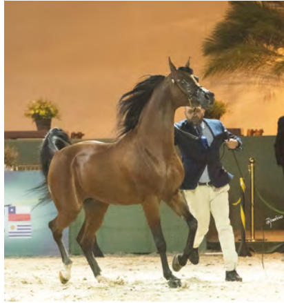
Jupiter Rach Silver Champion Stallion