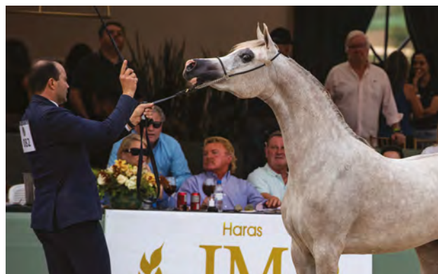
Silver Champion Filly Rose Goldea HDC