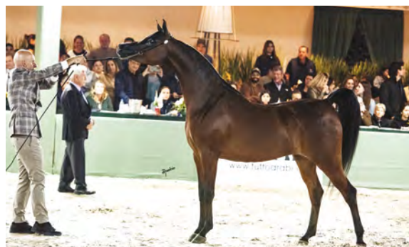
Bronze Champion Young Mare Llis Al Hayat