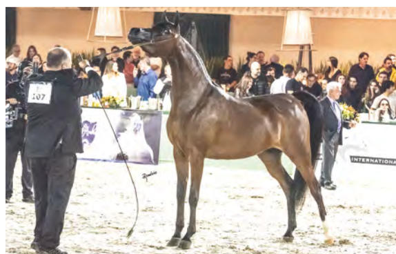
Silver Champion Young Mare Melody By Vivaldi