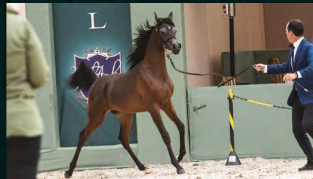
Silver Champion Junior Junior Filly Rfi Ballerina