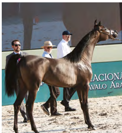
HES Ibiza Gold Champion Junior Filly