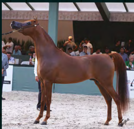
Silver Champion Colt Patrick Rec