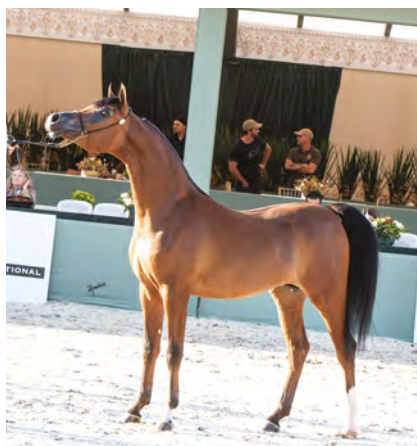
AF Borak Gold Champion Junior Colt