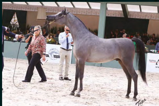
Silver Champion Young Colt Domenico FWM