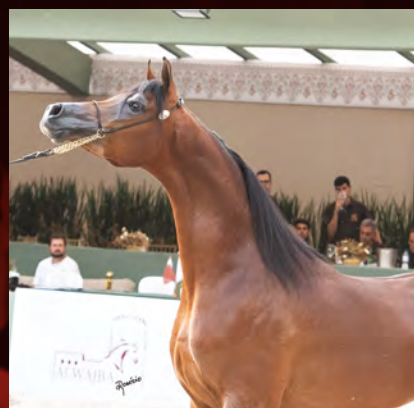
Bronze Junior Male Champion Ibn Image WN