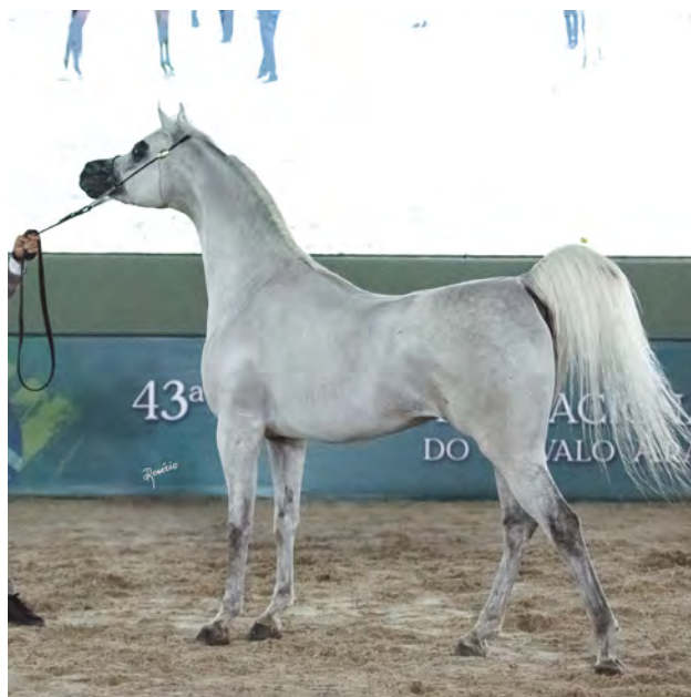
Bronze Champion Young Stallion Lughan HVP

a video of him. I liked what I saw and went to see him in person—I was captivated. When I saw him trotting, I felt a connection, something I still feel today. At the show, he won both events he entered, the Breeders International and the Scottsdale Show, competing against over 25 colts in the ring. I bought and brought him to his first National in 2022 as a Junior Colt. Despite arriving just before the show and not being fully prepared, Maxilillion still took Bronze. The next year, he won Silver, and this year, even as one of the youngest in the Championship, he dominated the ring like an adult stallion, claiming the Gold.”