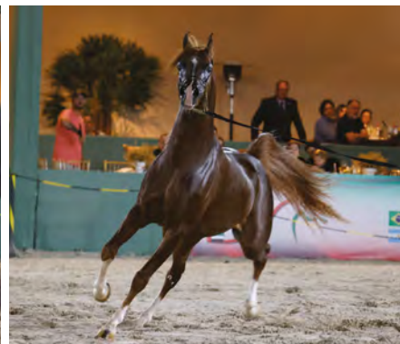
Bronze Champion Stallion Abbas Al Ventur