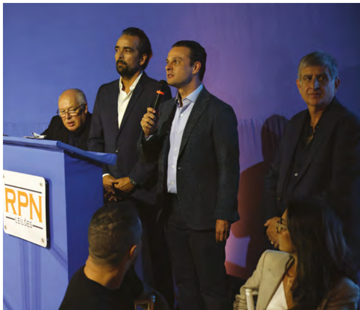
Brazilian Legends Arabian Auction