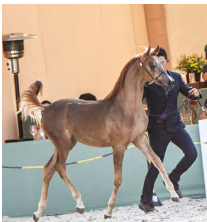
Ifrank Di Harjeet JM Silver Champion Junior Colt