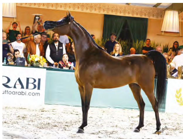
Silver Champion Mare Ultraah Serondella