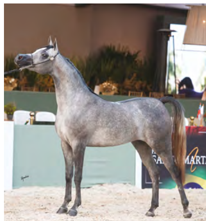
Patrass Navarre Bronze Champion Filly