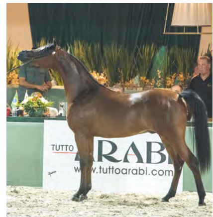
Khywan HEC Bronze Champion Colt