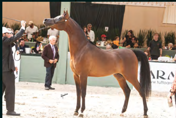
Bronze Champion Young Colt Amir Serondella