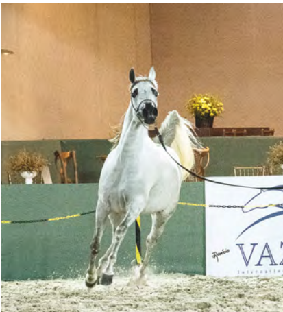
Queen Elinor FWM Gold Champion Mare