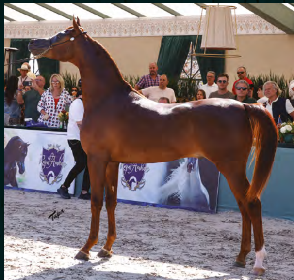
Gold Champion Young Colt RFI Pavarotti