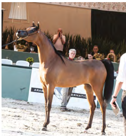
Indsky Witdiamond NY Silver Champion Filly