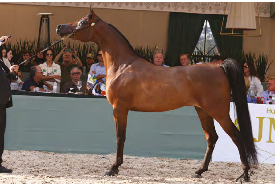
Gold Champion Filly Fabreanne HVP